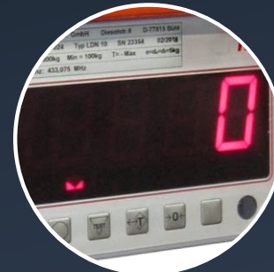
42mm large and illuminated display