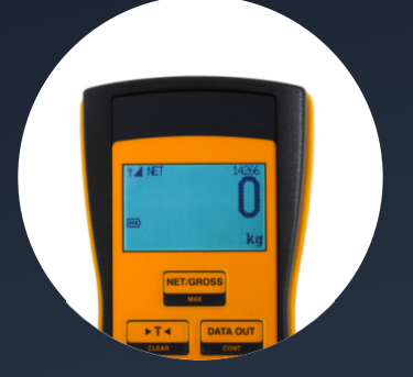
Large Display on remote control