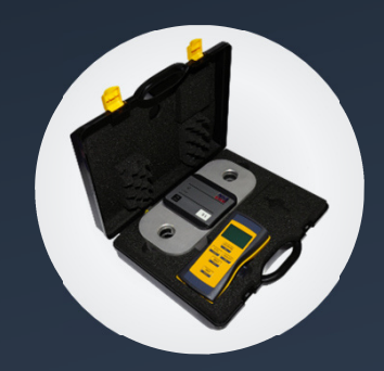
Handy transport case